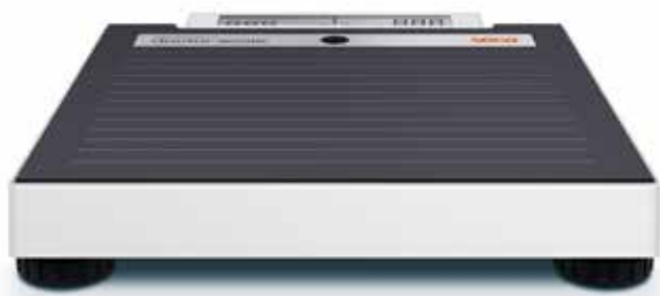
The flat construction and non-slip tread make it stable and comfortable to step onto.

A good name is earned through quality and modern functionality. That is why the seca 878 dr has been labelled the "doctor scale". It indicates the value of the product while reflecting the professionalism of the user. The label gives users certainty about the precision of the measured values and can be personalised. Further information can be found at www.seca.com/doctorscale .